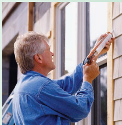
Touchstone Energy Cooperatives

A: If your windows now are single pane, installing storm windows can provide a payback in the 7-9-year range. Replacement windows may take considerably longer. You may have reasons other than saving energy for purchasing replacement windows.