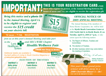
Official Notice/Registration Postcard

Only members who register, in person, to participate in the Annual Meeting of Members between the hours of noon and 7 p.m. on Tuesday, April 14, are eligible to receive the electric bill credit. To register, you will need your Official Notice/Registration Postcard that was addressed to you, PLUS a photo ID.