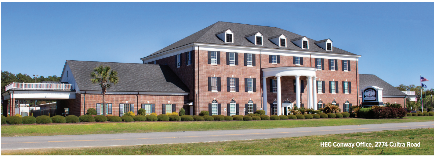
HEC Conway Office, 2774 Cultra Road